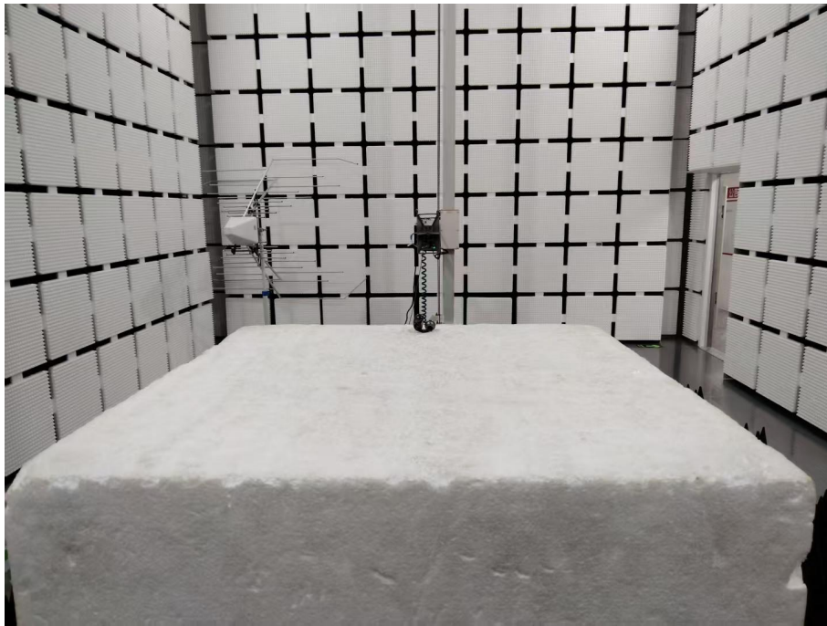
Radiated Spurious Emission (below 1GHz)