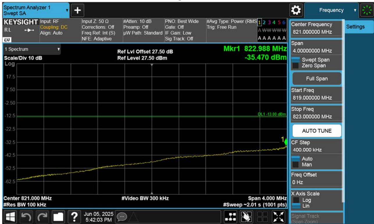
LTE B26_ Lower Extended Band Edge Plot (1.4 M BW Ch.26797 QPSK_RB6_0)