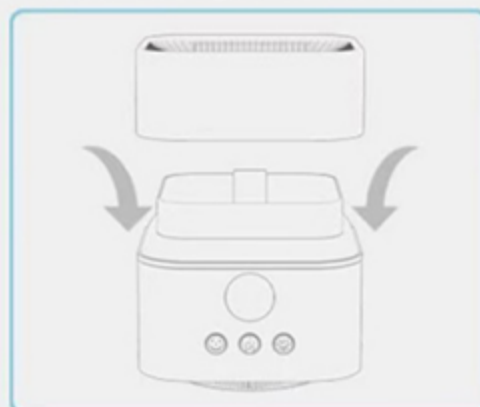
4. Install the cover correctly