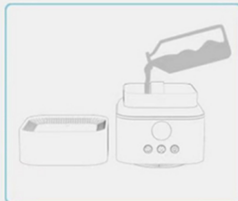
2. Add water, careful not to exceed the highest water level