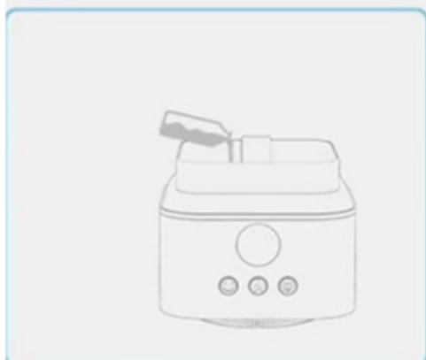
3. Add proper amount of essential oil