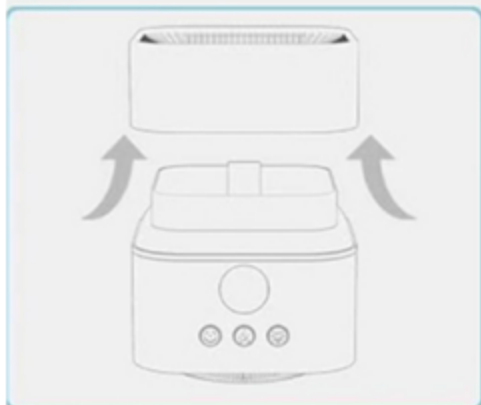
1. Remove top cover