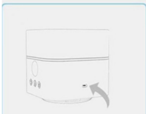
5. Insert the adapter and start running