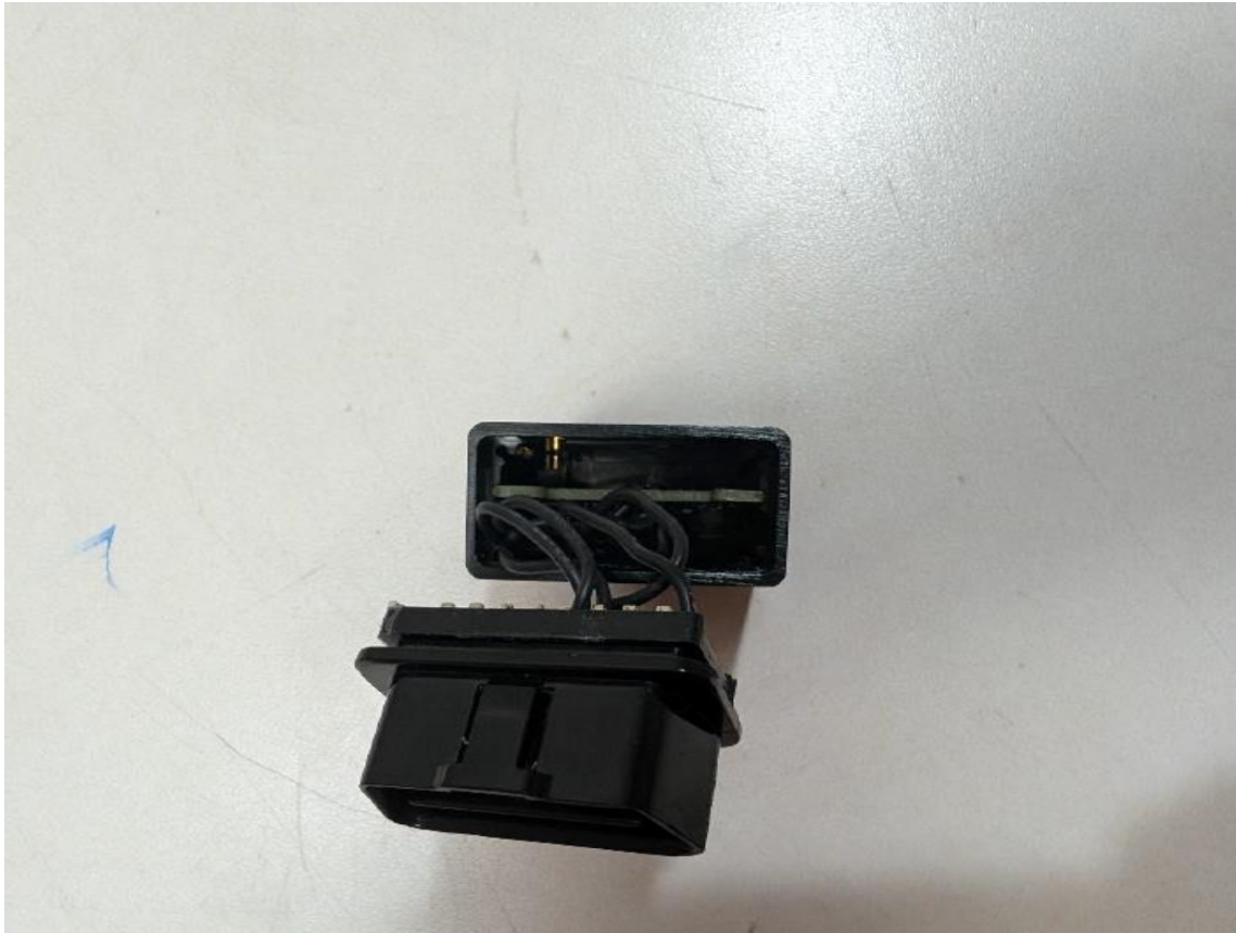
Photograph 4 – View of the PCB Mounting in the Enclosure