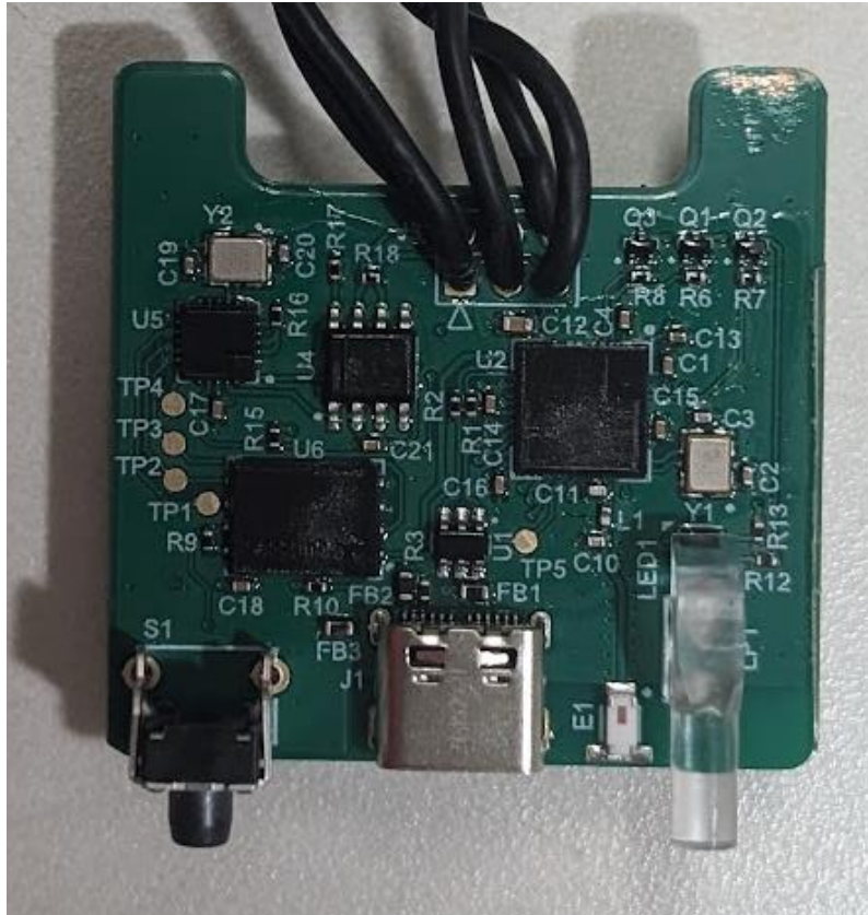
Photograph 1 – Front View of the PCBA