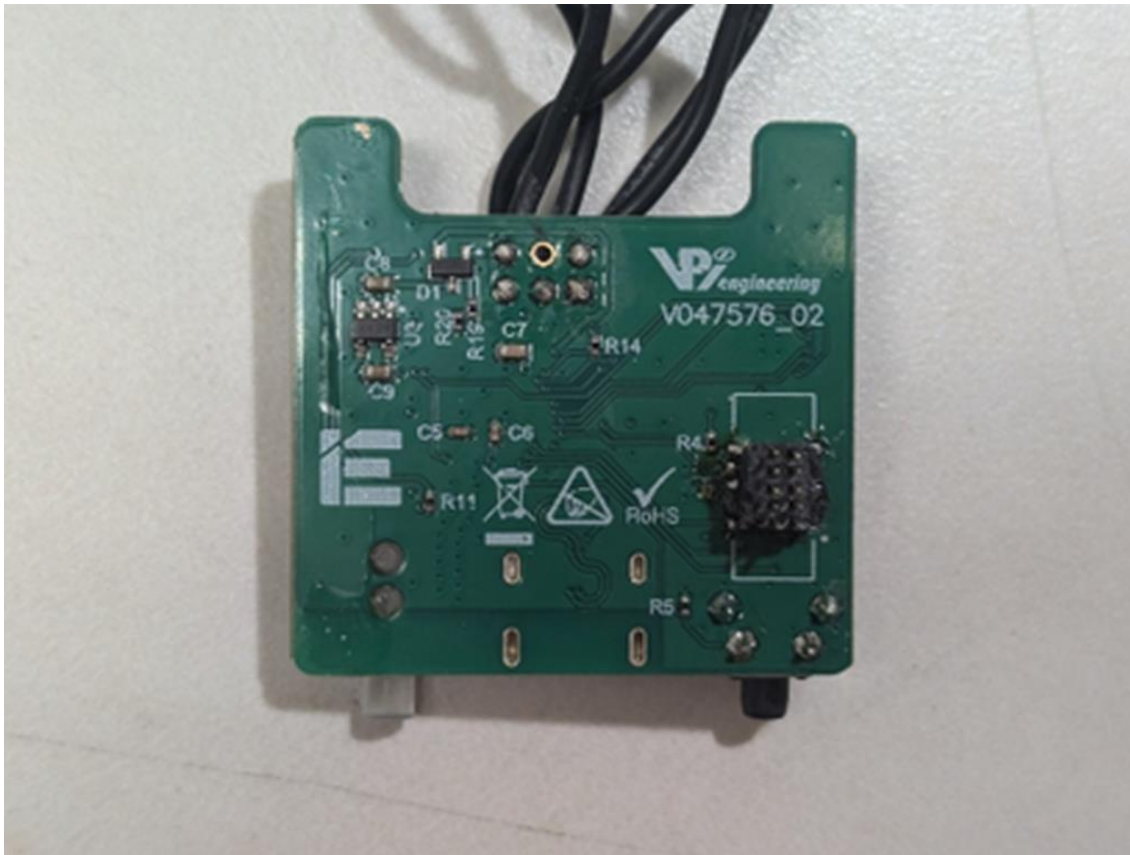
Photograph 2 – Back View of the PCBA