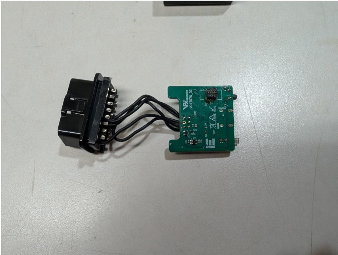
Photograph 5 – View of the PCB removed from enclosure