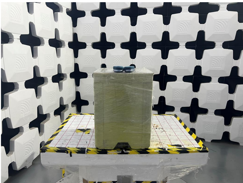
Above 1GHz The EUT is placed at the center of turntable