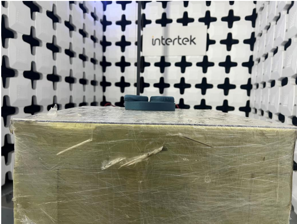
Above 1GHz The EUT is placed at the center of turntable