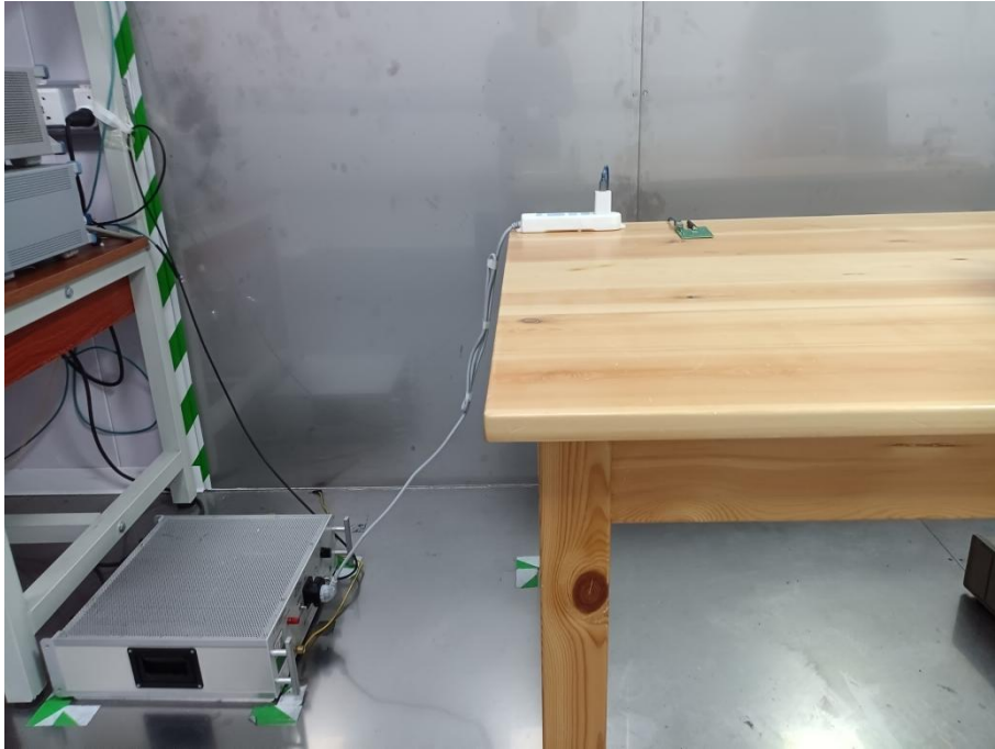
Band edge emissions (Radiated) Undesirable emission limits (above 1GHz)