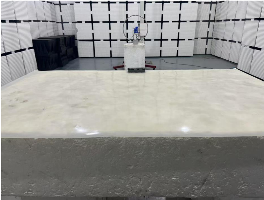
Set-up for Transmitter & Receiver Spurious Emissions, 30MHz to 1000MHz