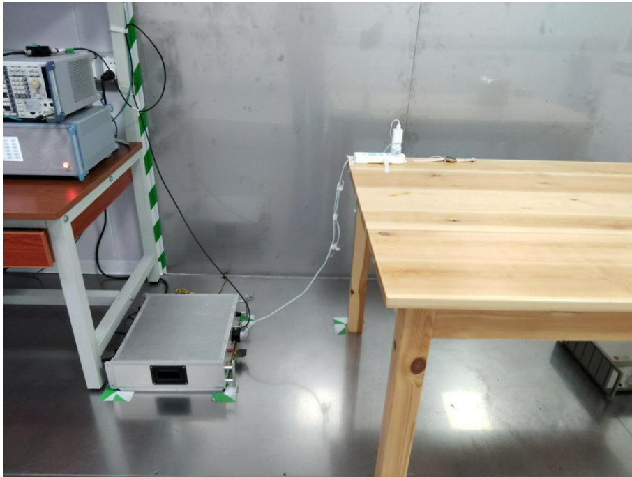
Radiated band edge emission Radiated Spurious Emission (Above 1GHz)