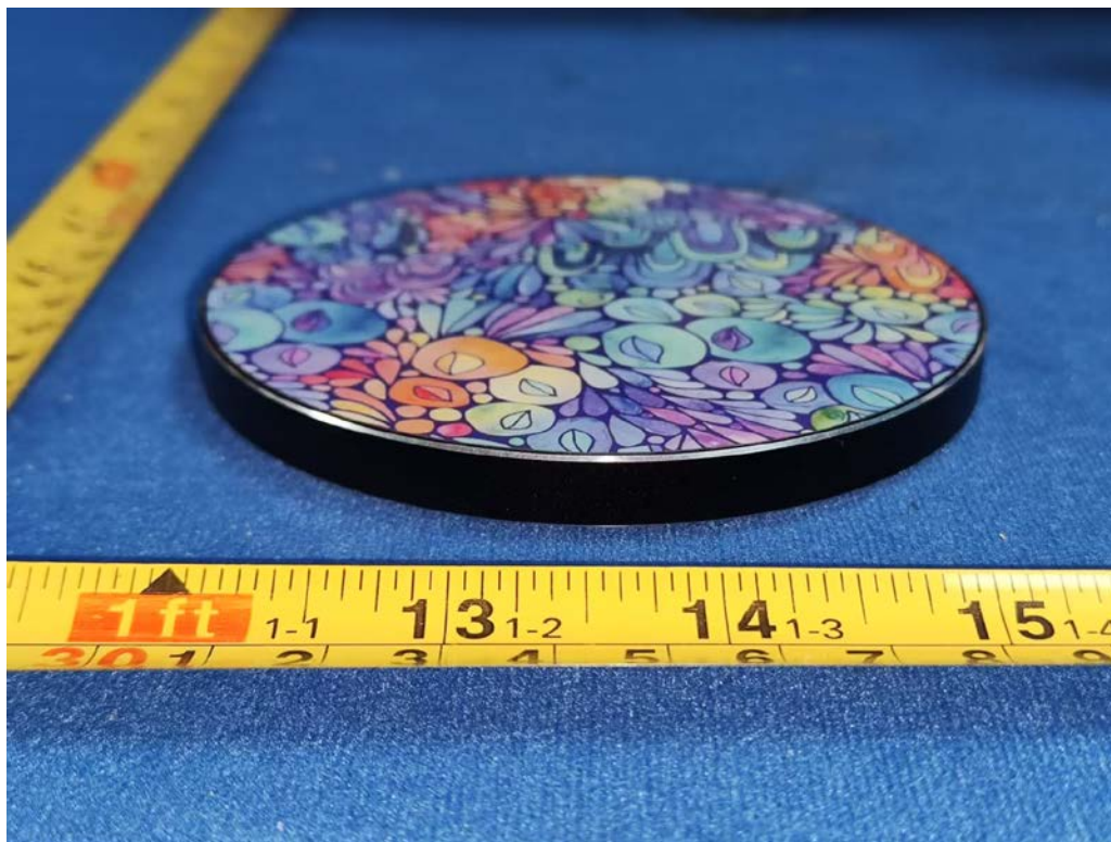
FIGURE 4 FAST WIRELESS CHARGER (HD01) RIGHT APPEARANCE