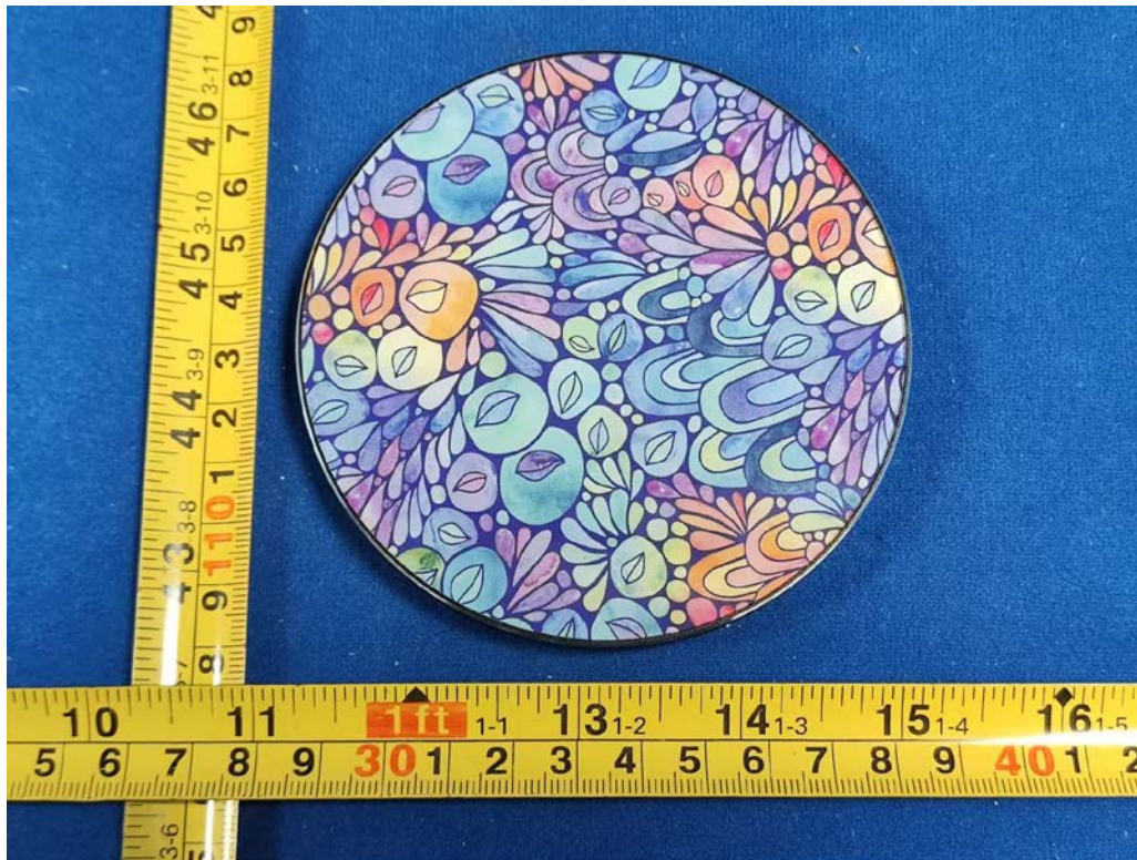
FIGURE 6 FAST WIRELESS CHARGER (HD01) BOTTOM APPEARANCE