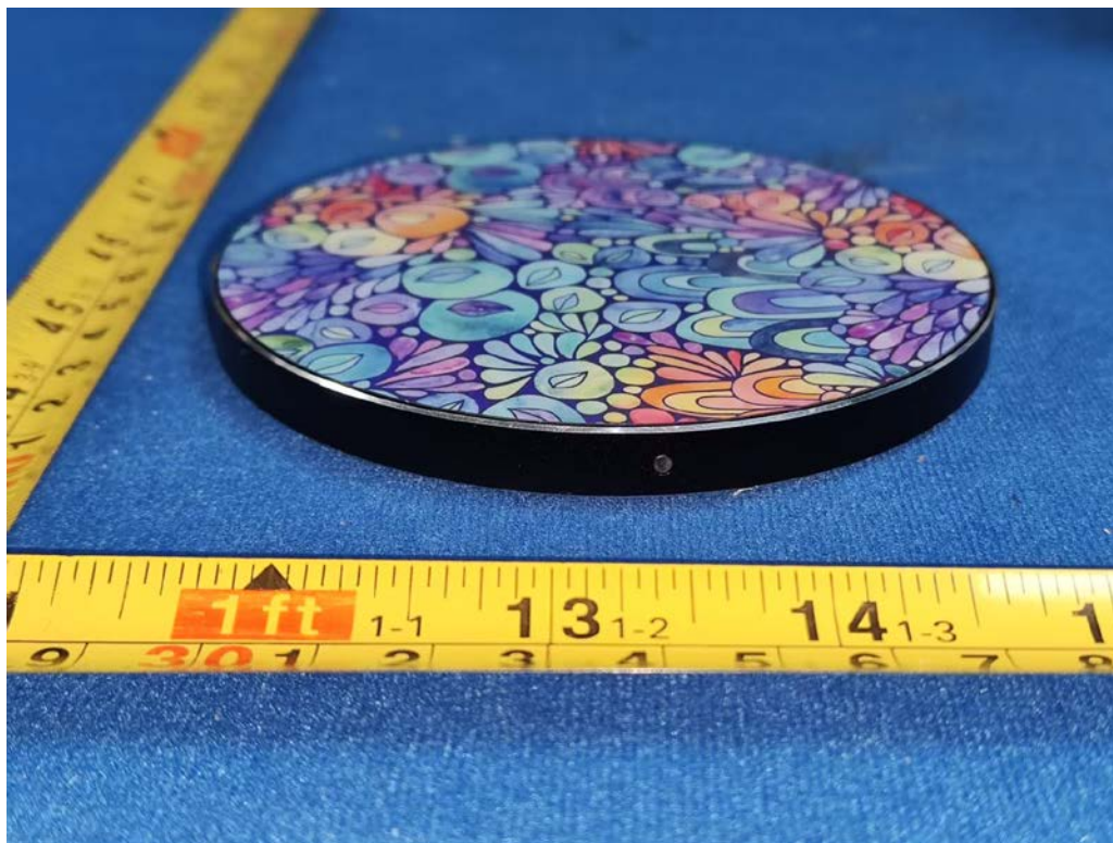
FIGURE 2 FAST WIRELESS CHARGER (HD01) BACK APPEARANCE