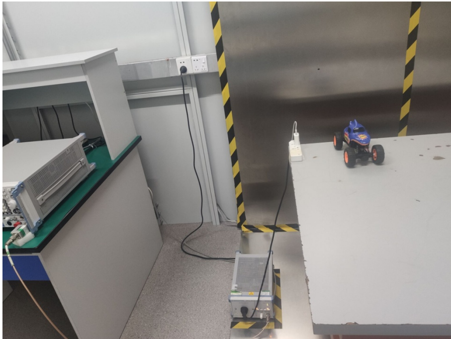
RF Conducted Emission