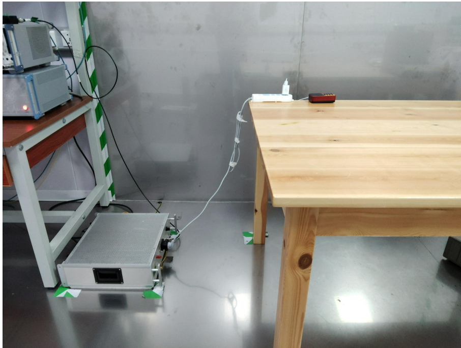
Radiated Spurious Emission (below 1GHz)