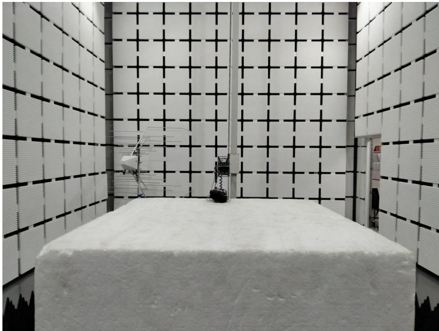
Radiated Spurious Emission (below 1GHz)