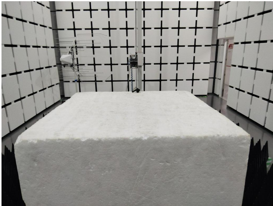
Radiated Spurious Emission (below 1GHz)