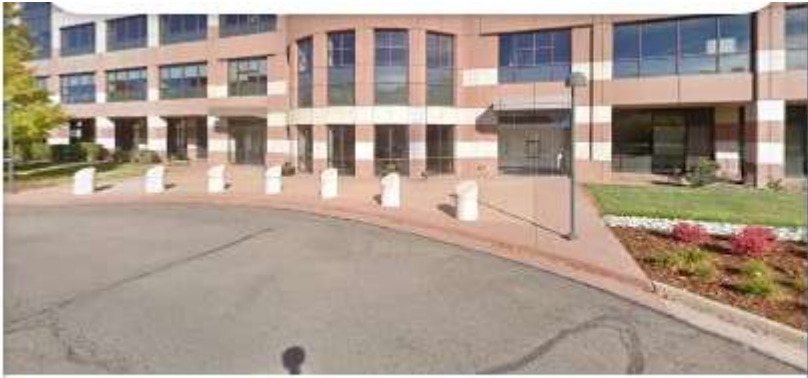
7595 Technology Way