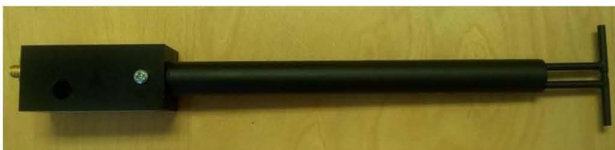
Figure 1 – MVG COMOSAR Validation Dipole

MVG's COMOSAR Validation Dipoles are built in accordance to the IEC/IEEE 62209-1528 and FCC KDB865664 D01 standards. The product is designed for use with the COMOSAR test bench only.