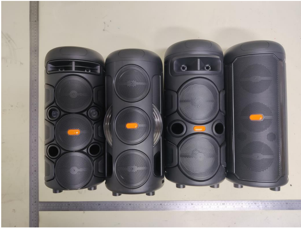
ALL VIEW OF EUT-2