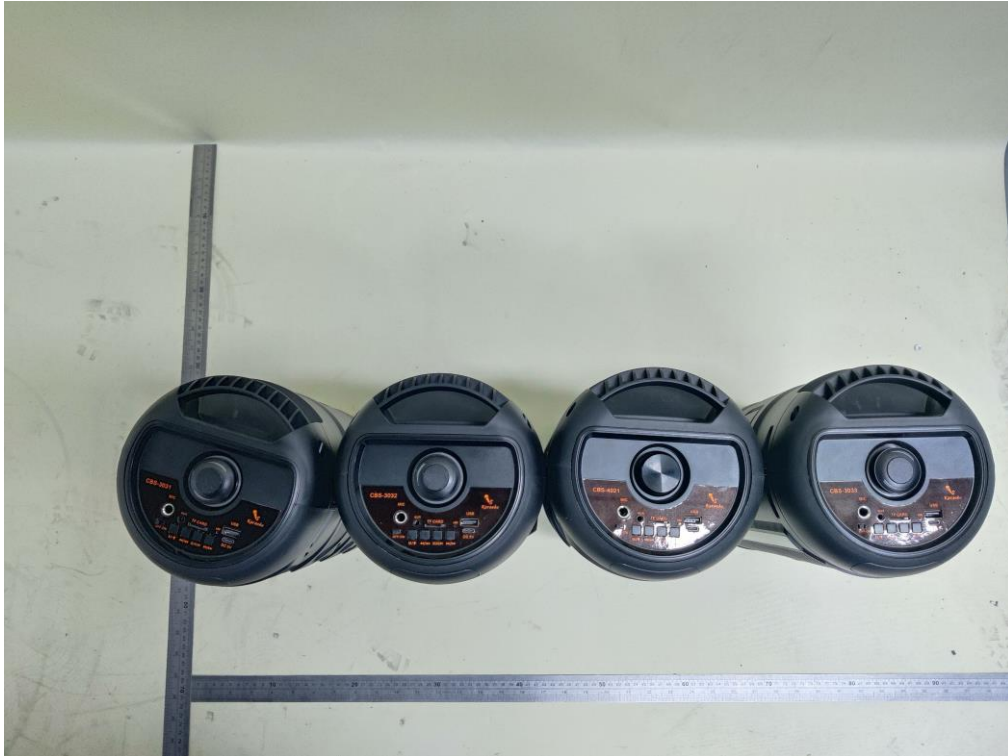
ALL VIEW OF EUT-4