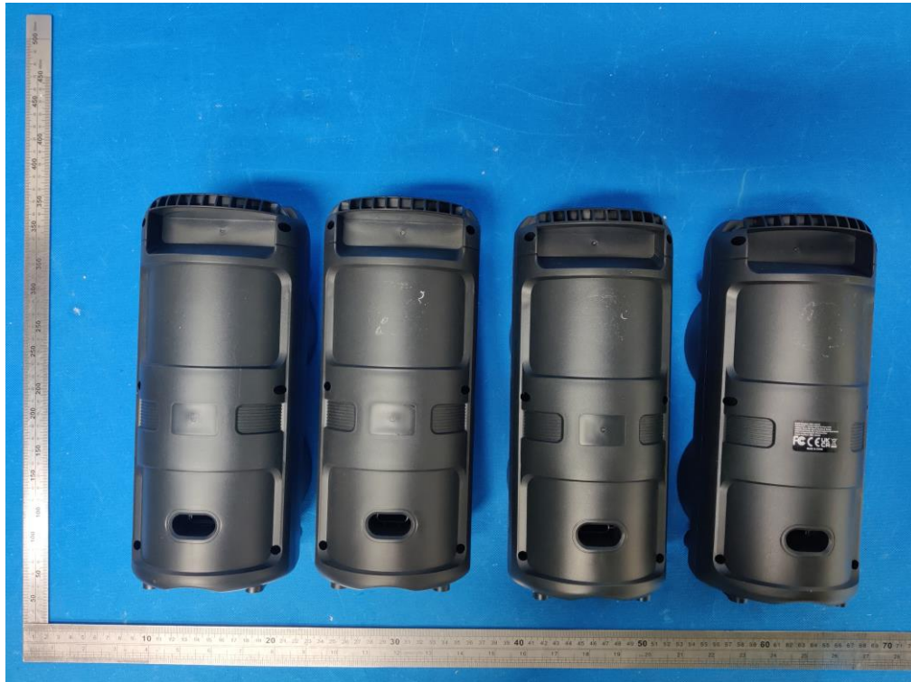
ALL VIEW-2 OF EUT