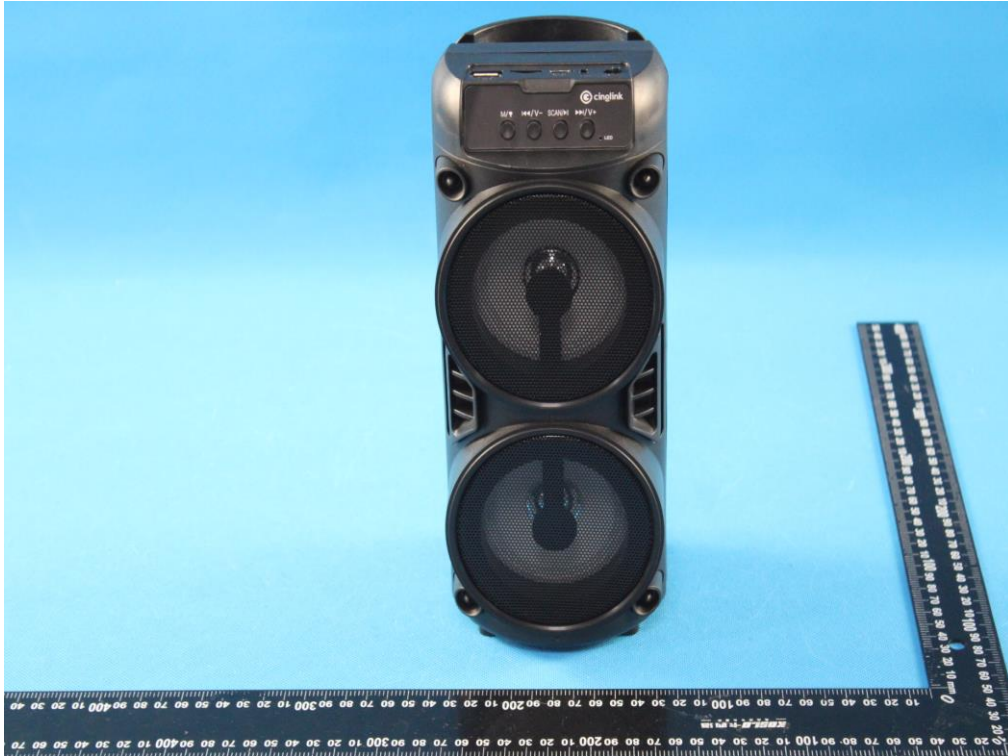
VIEW OF EUT FOR MODEL CBS-3025E