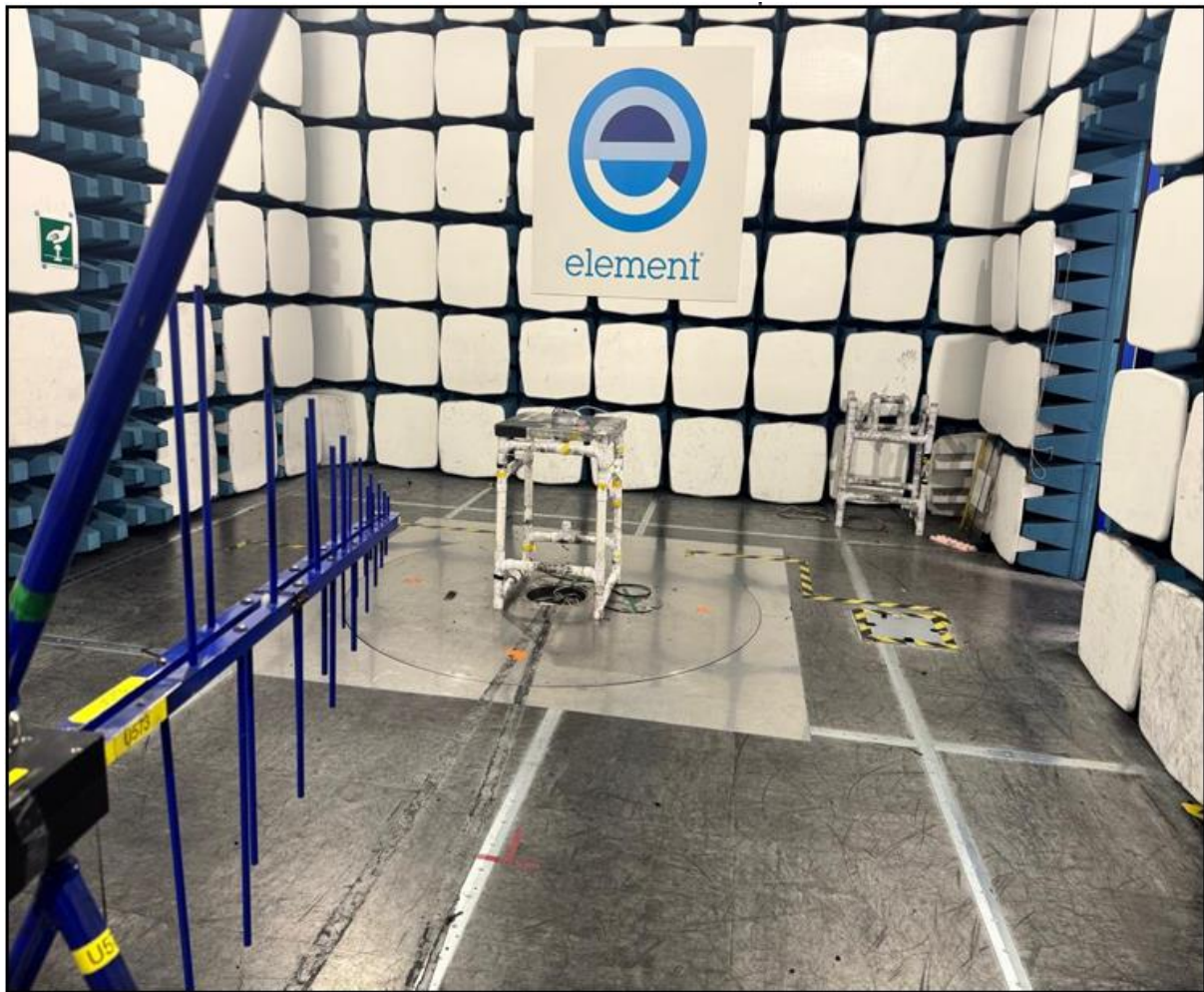
30MHz to 1GHz – Radiated