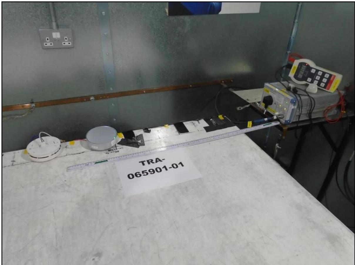
Power Line Conducted Emissions