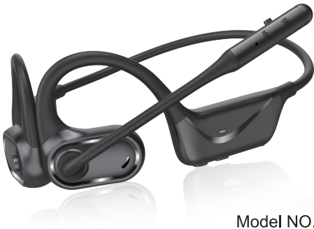
Model NO.: HT03