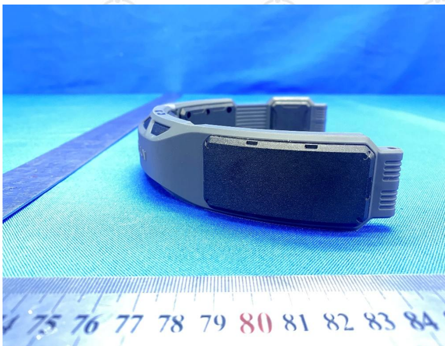
View of Product-04