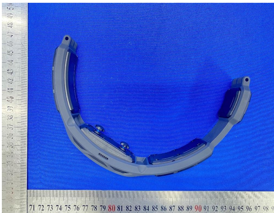
View of Product-07