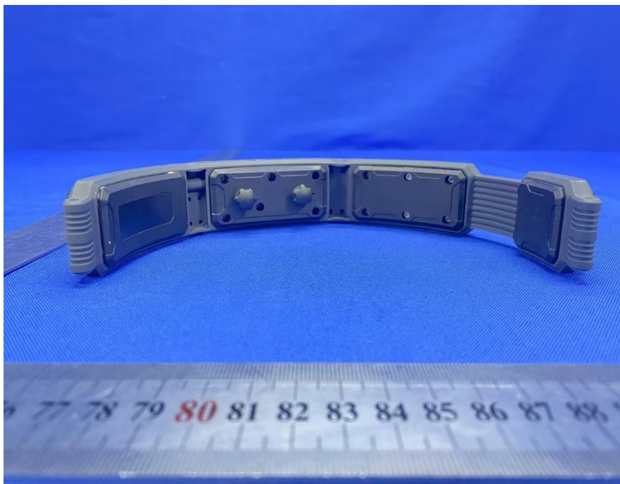
View of Product-05