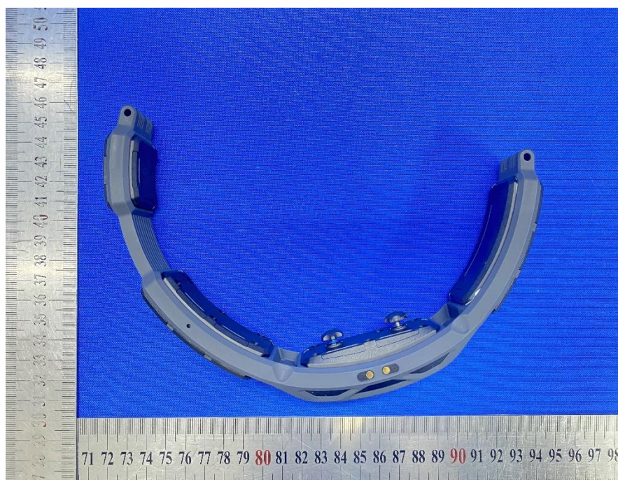
View of Product-02