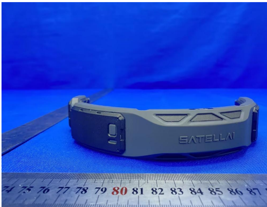
View of Product-03