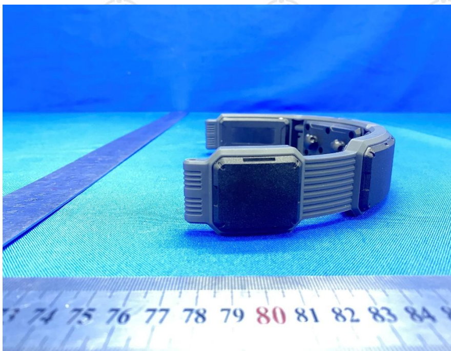
View of Product-06