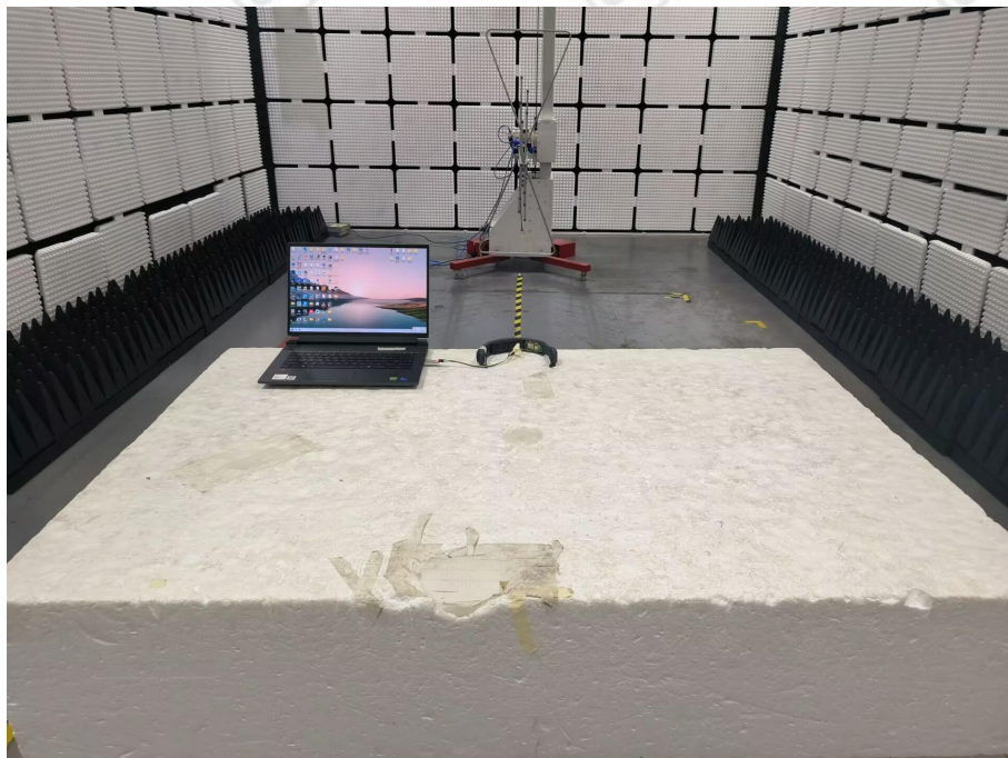
Radiated spurious emission Test Setup-1(Below 1GHz)