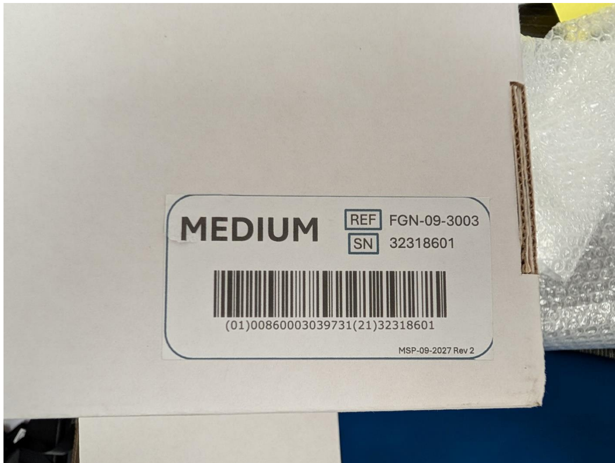
Box Barcode Label, Medium