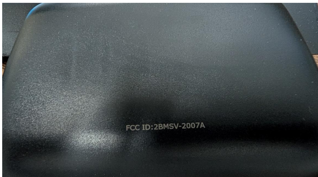
Device FCC Label, Vibration Pack (not visible from outside, but permanently etched onto emitting device)