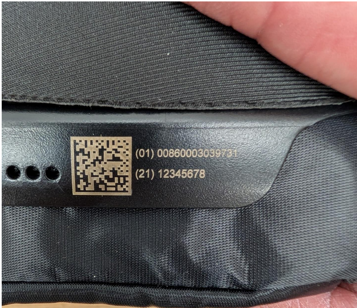
Device Barcode Label, Medium