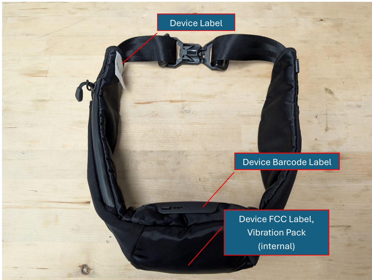
Locations of Labels on FGN-09-300X Osteoboost