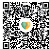
Love Spouse App