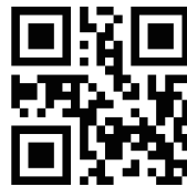
Device Binding Code "1100"