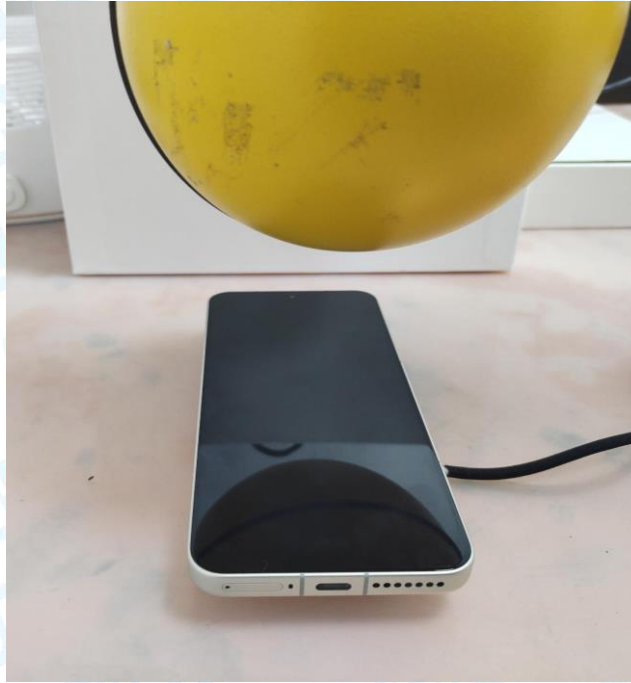
Test Set-up Photo