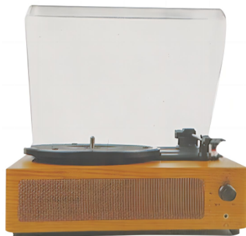
Retro Wood Grain Series Turntable