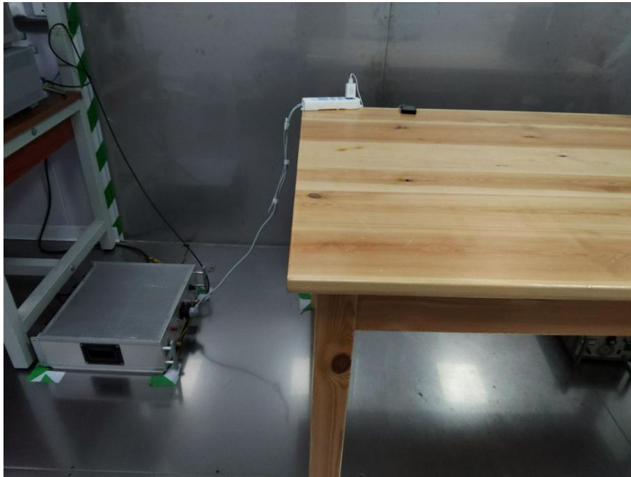
Radiated band edge emission Radiated Spurious Emission (Above 1GHz)