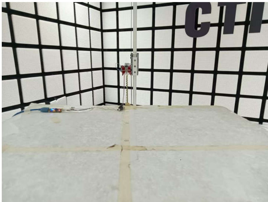
Radiated spurious emission Test Setup-3 Ear L (Above 1GHz)