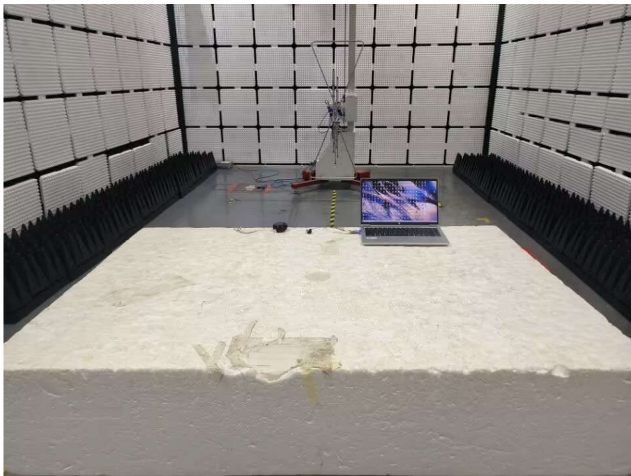
Radiated spurious emission Test Setup-2 Ear R (Below 1GHz)