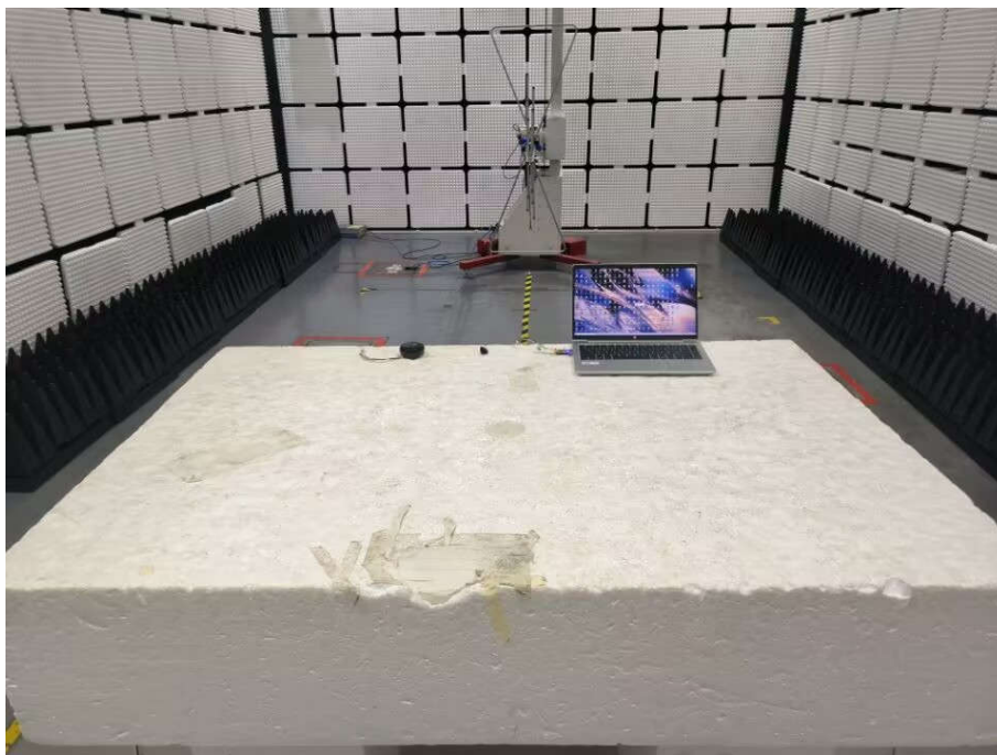
Radiated spurious emission Test Setup-1 Ear L (Below 1GHz)