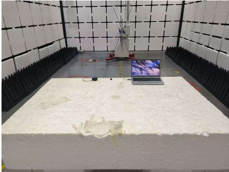
Radiated spurious emission Test Setup-1 Ear L (Below 1GHz)