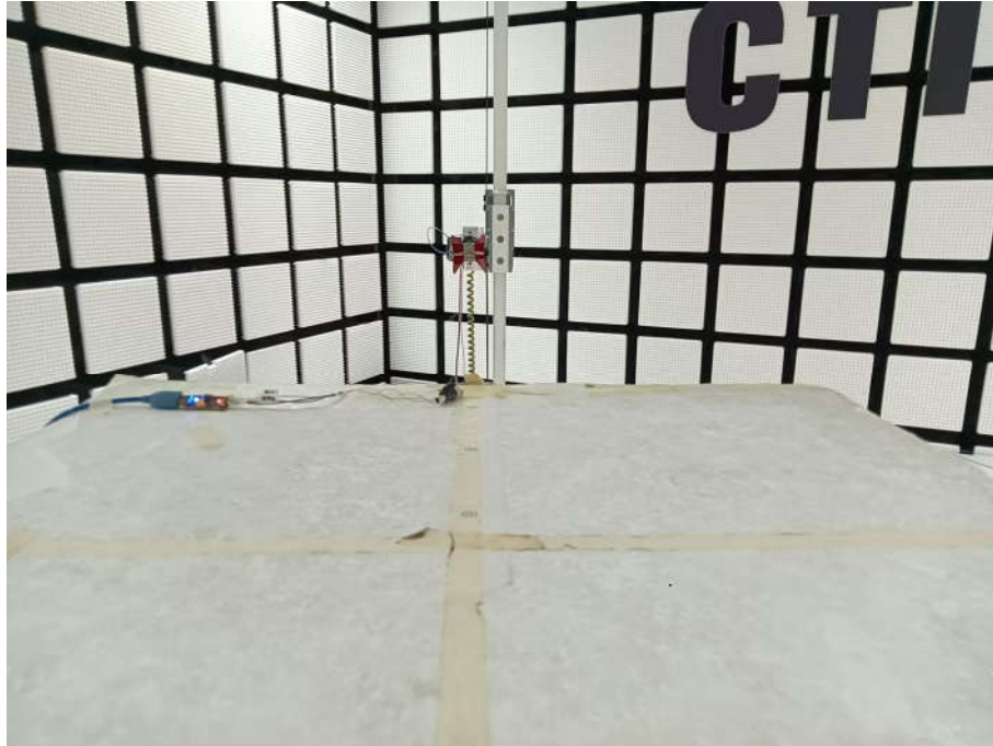
Radiated spurious emission Test Setup-3 Ear L (Above 1GHz)