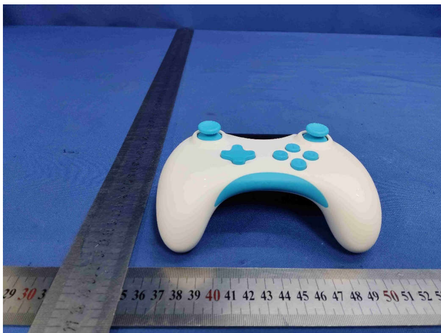
View Of Product-02