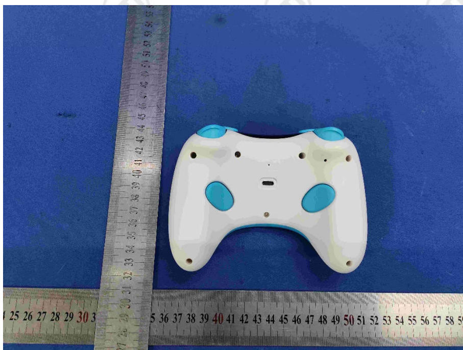
View Of Product-06