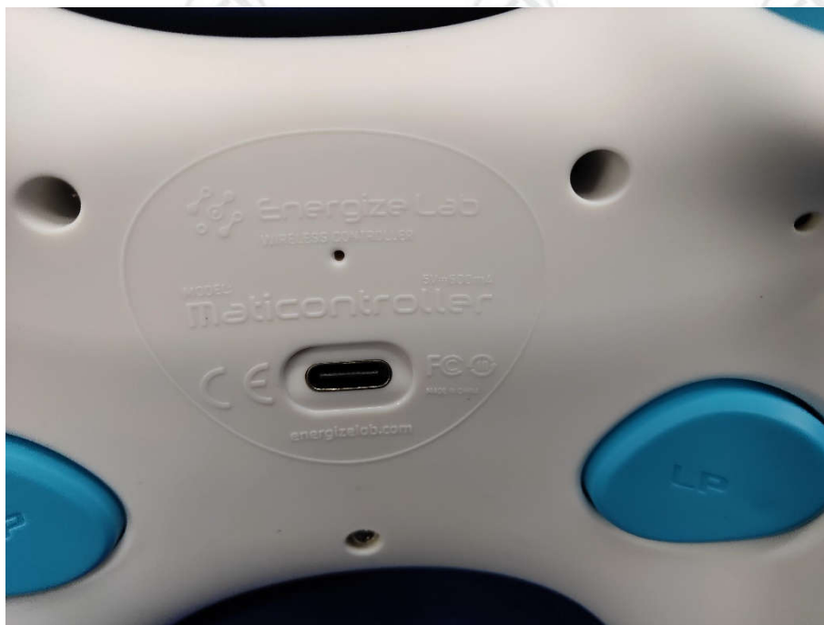
View Of Product-07