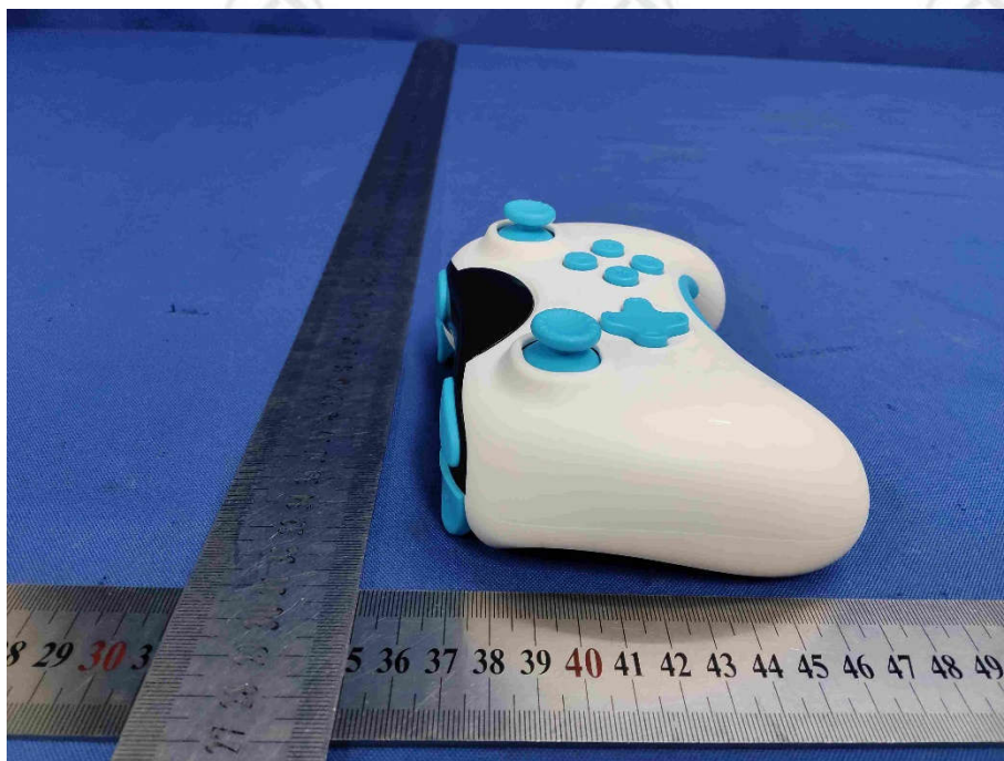
View Of Product-05