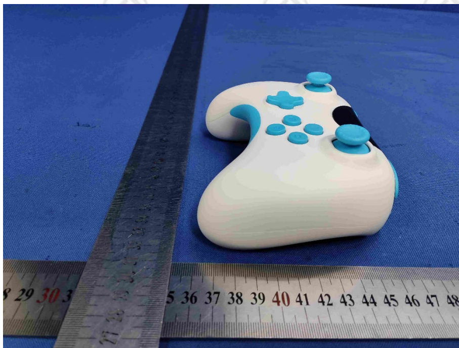
View Of Product-03