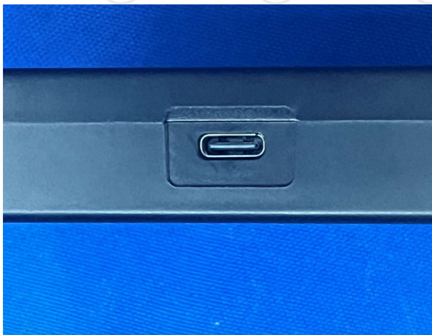
View of Product-08