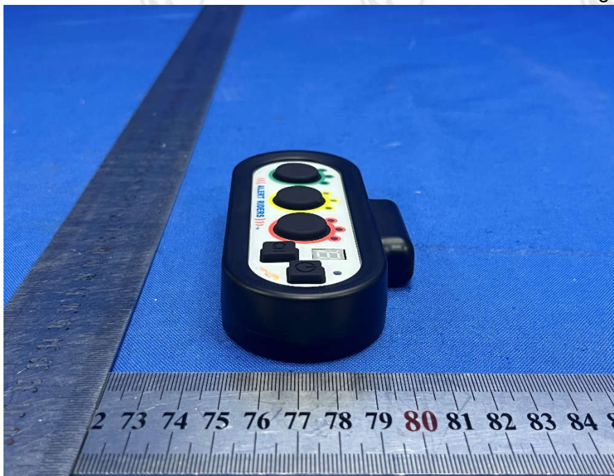
View of Product-07