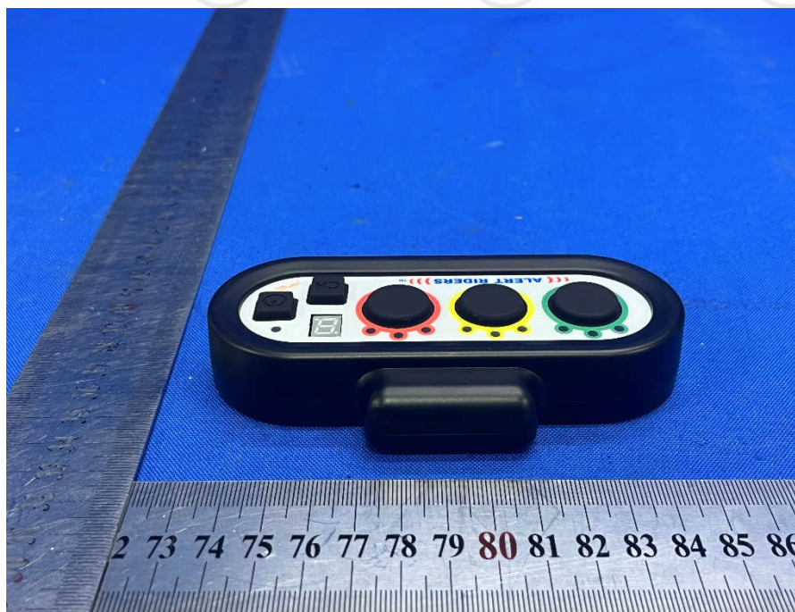
View of Product-04