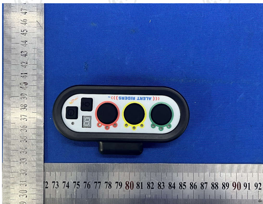
View of Product-02