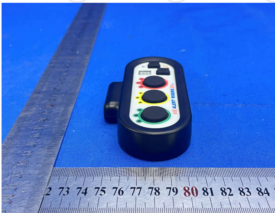
View of Product-06