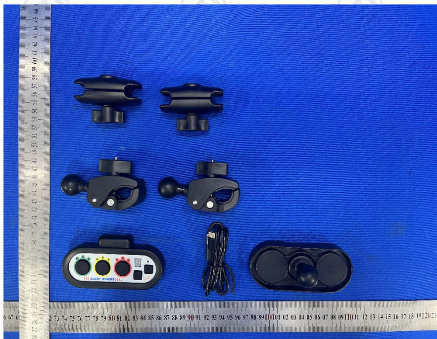
View of Product-01