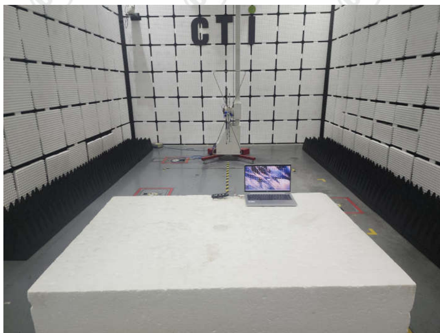
Radiated emission Test Setup-1 (30MHz~1GHz)