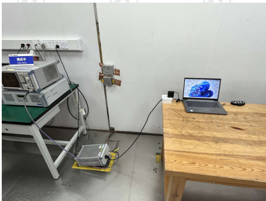
Conducted emission Test Setup