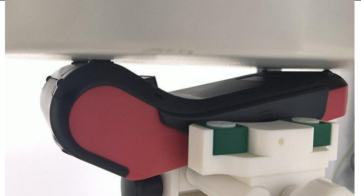
Back Side (Separation distance of 0mm)