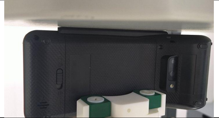
Right Side (Separation distance of 0mm)