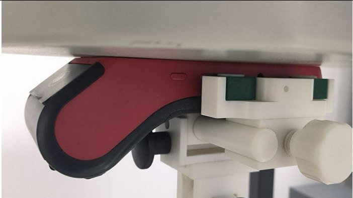
Front Side (Separation distance of 0mm)