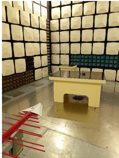
Test Setup – Radiated emission from 30 MHz to 1 GHz