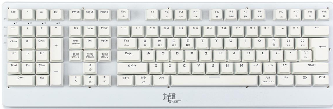
ZY-2218 Conquer the World 111 keys