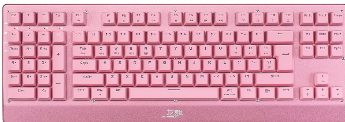
ZY-2216 Conquer the Ocean 108 keys