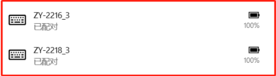
Keyboard power display on laptop

4.The R key is used for 2.4G wireless connection, and the receiver needs to be plugged into the computer. The receiver is located on the right side of the keyboard bottom cover.