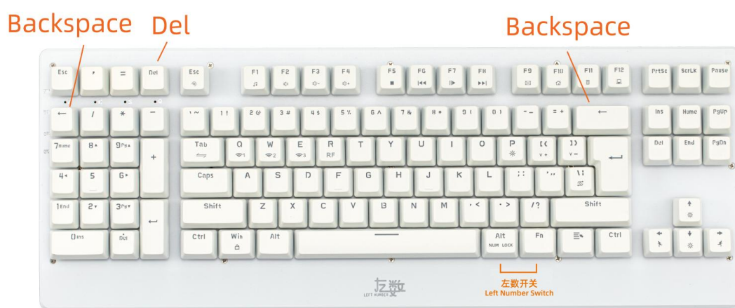
ZY-2216 Conquer the Ocean 108 keys