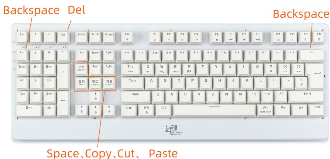
ZY-2218 Conquer the World 111 keys