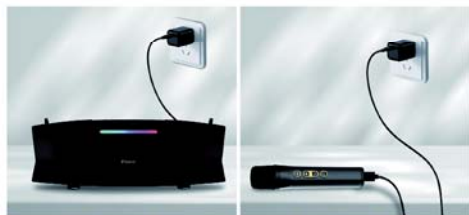
(2) Karaoke machine and microphone charging indicator status reference:

1) Karaoke machine charging LED indicator status display: The LED indicator is red when charging, and when full the LED indicator turns blue and is always on.