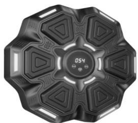
Smart music boxing target Instruction Manual