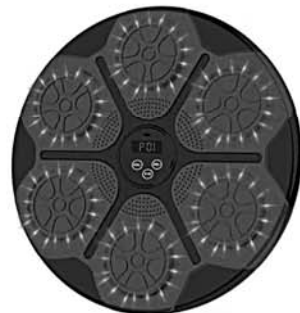
Smart music boxing target Instruction Manual