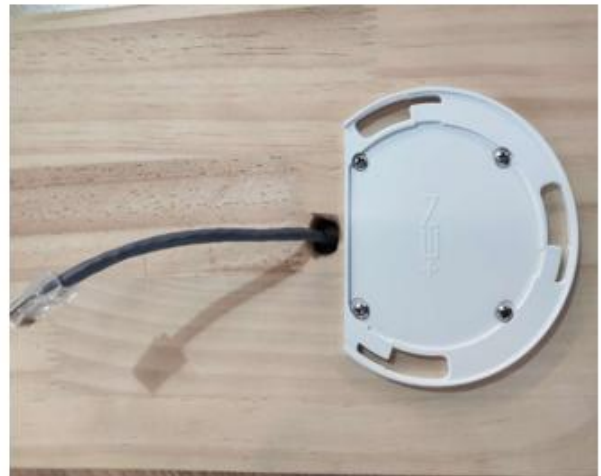
Intelligent gateway base installation signal