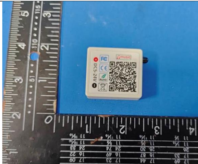
LED Strip Lights-1

Add: Hongzhi science and Technology Park, Hongying Industrial Zone, Fenggang town,Dongguan City, Guangdong Province China