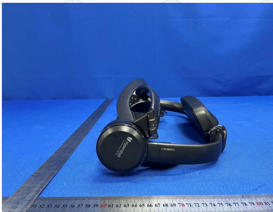
View of Product-08