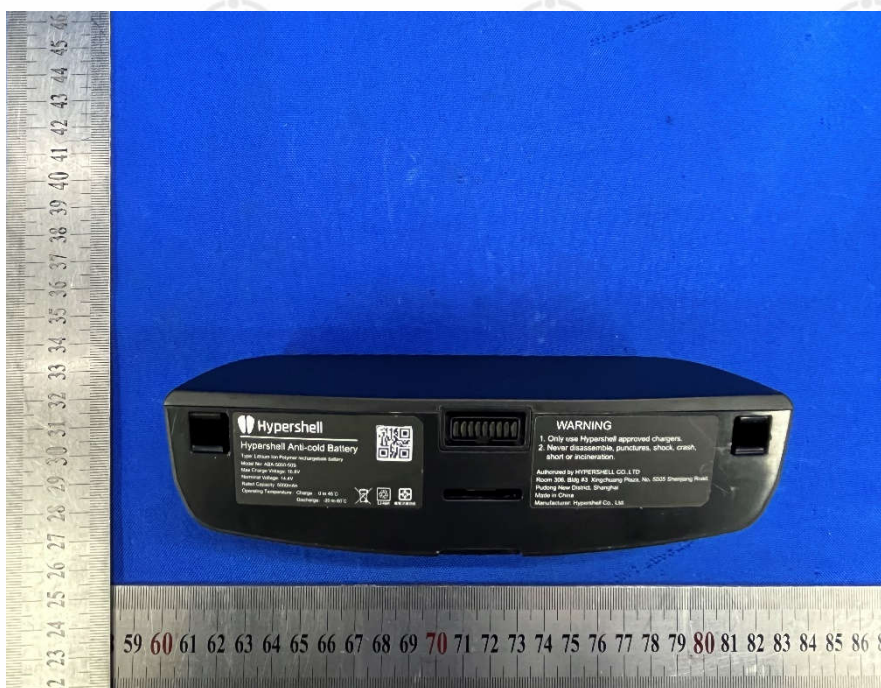
View of Product-12