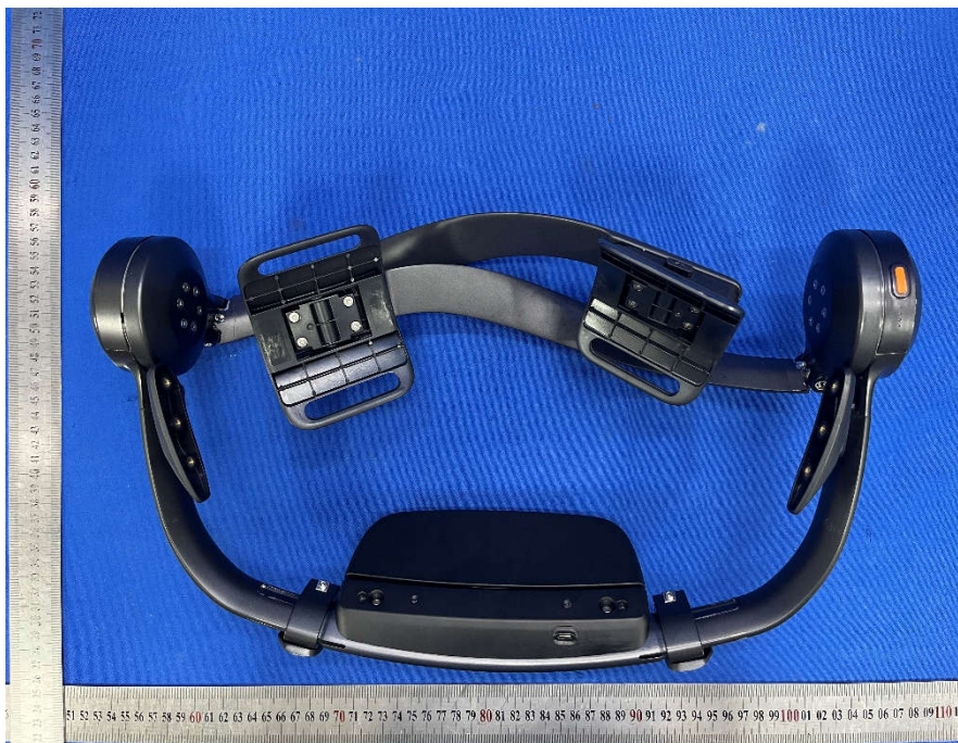
View of Product-03