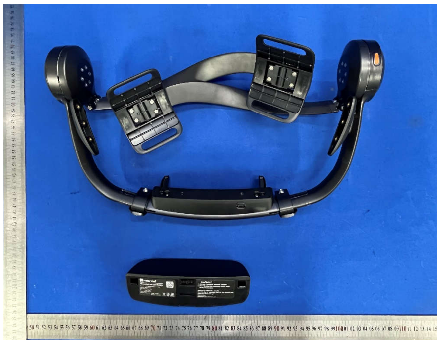
View of Product-11