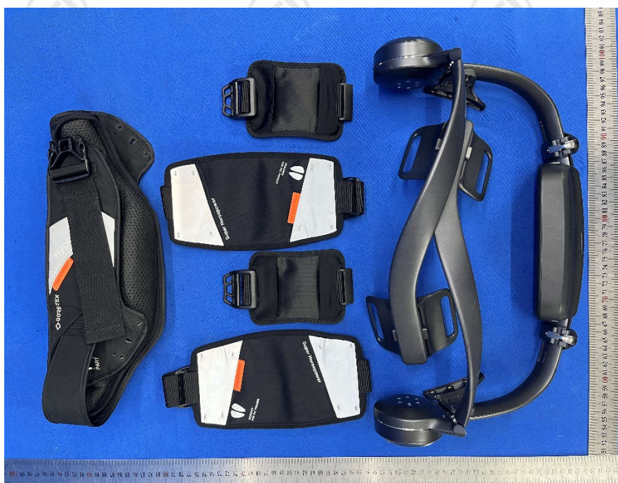
View of Product-02