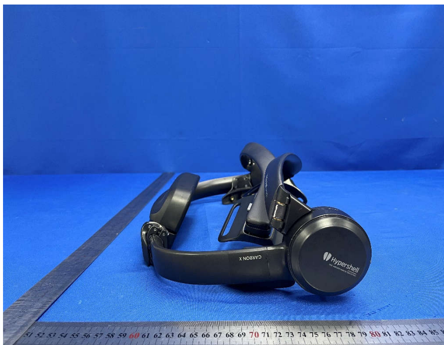
View of Product-05