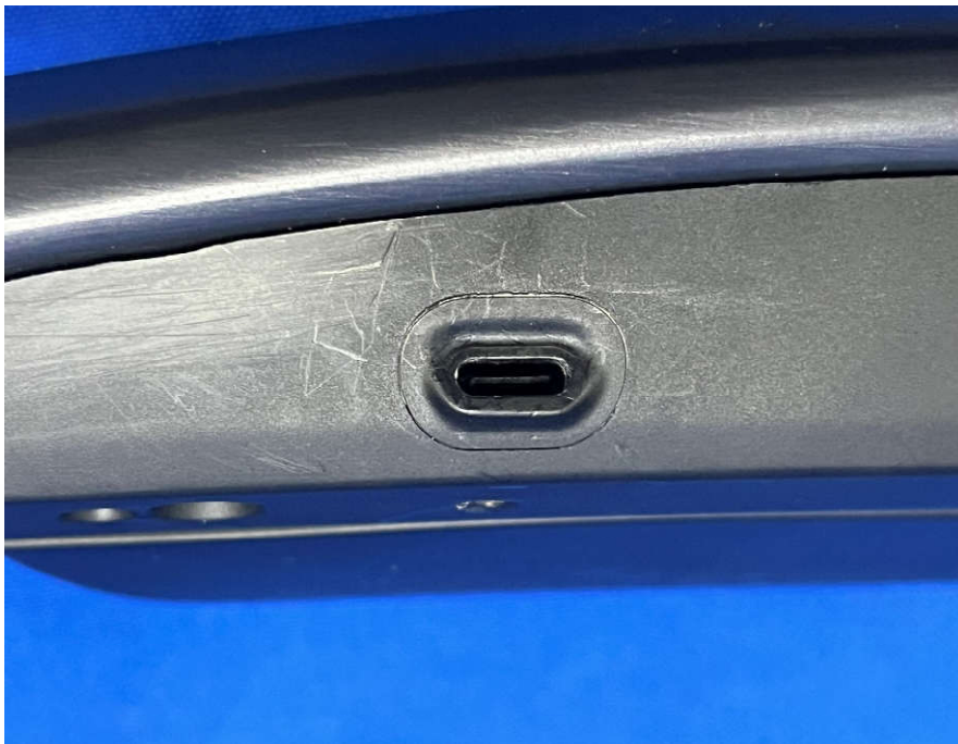
View of Product-09