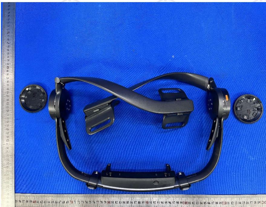
View of Product-10