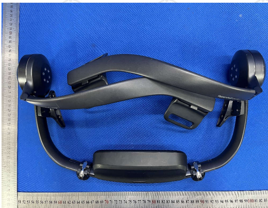
View of Product-04