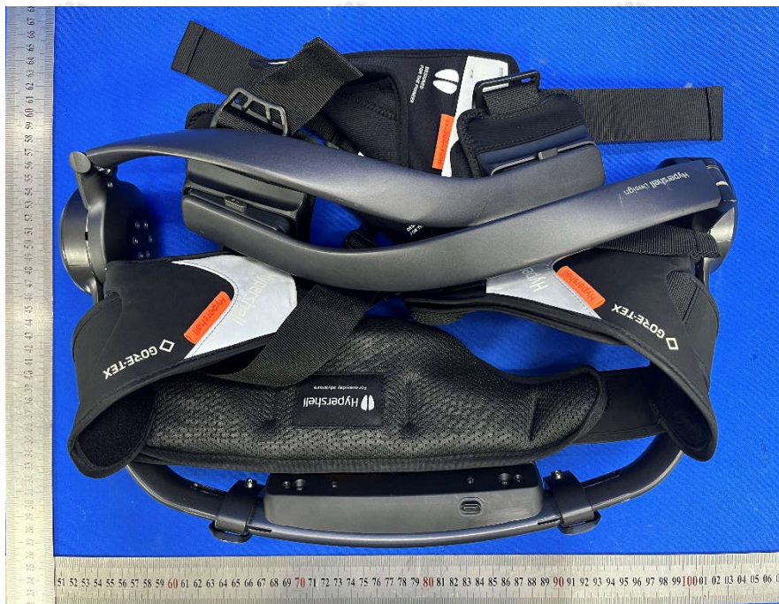
View of Product-01