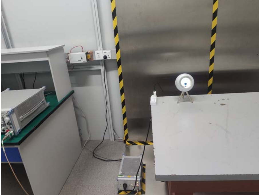
RF Conducted Emission