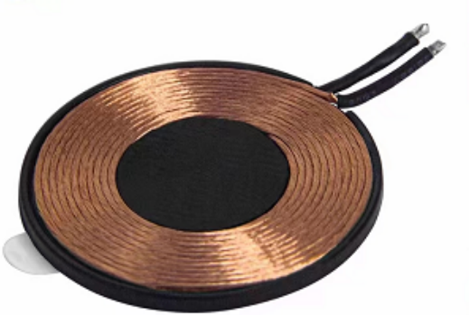
Antenna Top View [With Ruler]

All measurements were performed radiated and therefore additional antenna gain documentation is not required.