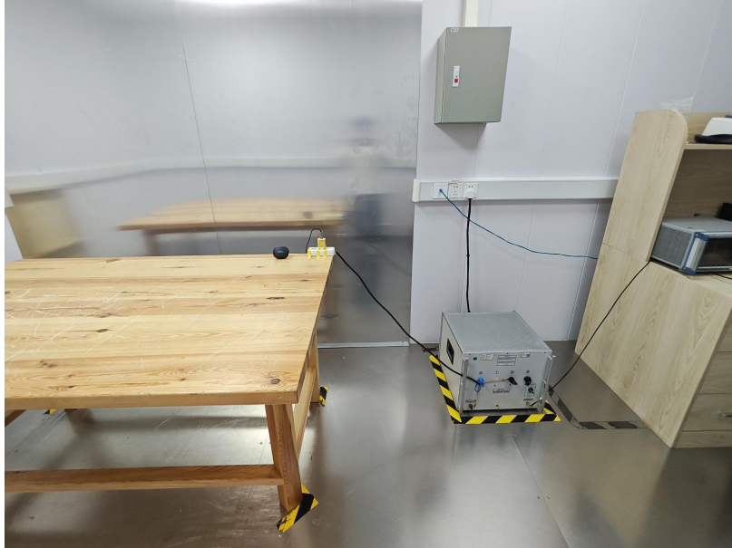
Radiated Emissions From 30M-1GHz