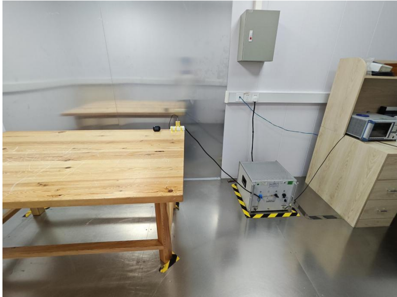
Radiated Emissions From 30M-1GHz