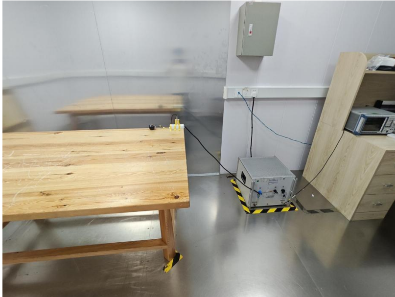
Radiated Emissions From 30M-1GHz