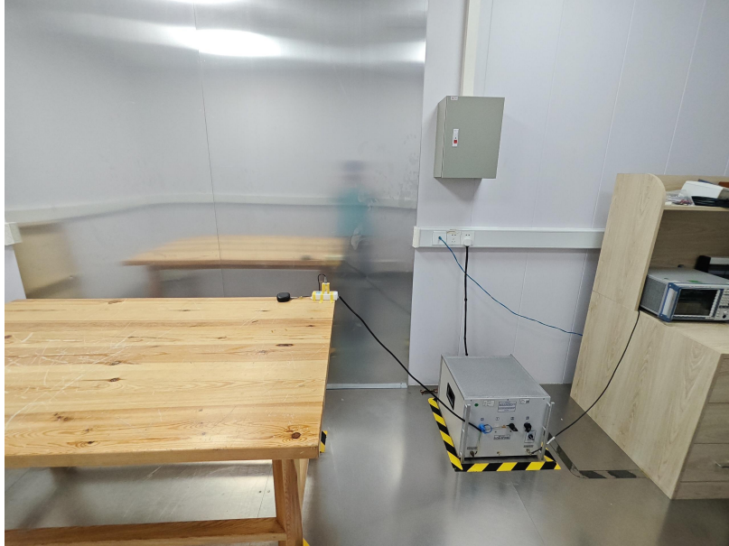
Radiated Emissions From 30M-1GHz