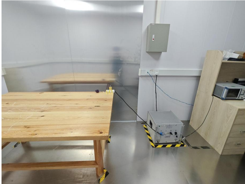
Radiated Emissions From 30M-1GHz