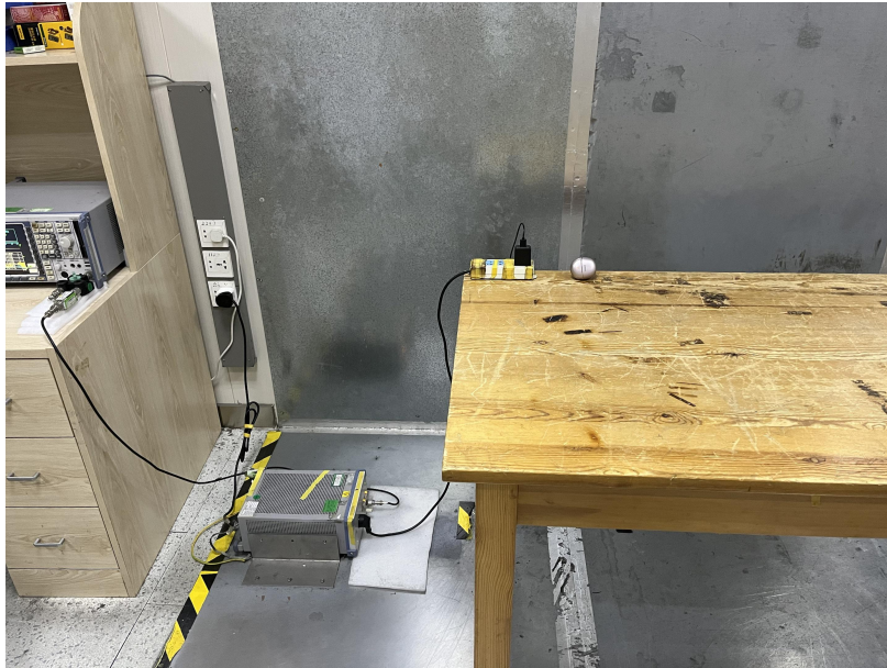
Radiated Emissions From 30M-1GHz