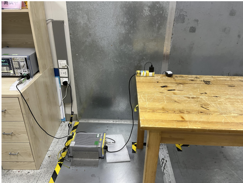
Radiated Emissions From 30M-1GHz